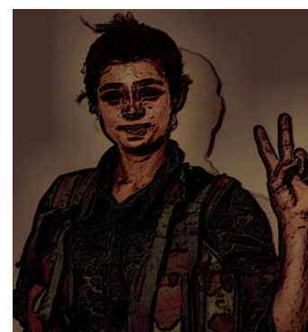
Sjarief, or Sayyid Baba

I'm going to tell you the story about Sharif, or Sayyid Baba and the 40 robbers. Sharif or Sayyid, which is one-and-the same, only named otherwise. It is a religious title of honour; think at the level of Governor. But Baba is not of this World. Baba is one of the 72 Heavenly Maidens ... She was ordered to investigate the problem of the many suicides, the many wars, the unforgiveness and the mercilessness in the Middle East... Why don't these people realize the 1st message of the Prophet? ... Being merciful? Why do they the opposite?