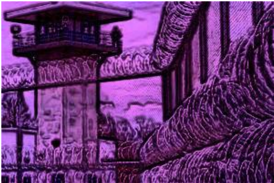
Turkish police barracks

No one shall be subjected to arbitrary arrest or detention.